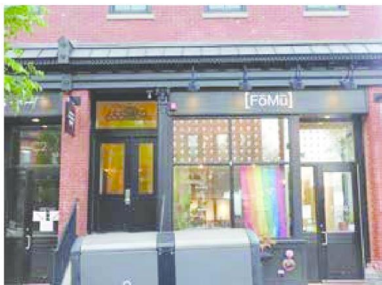
This year's Pride Parade is canceled due to COVID-19.

Normally, in the issue of the South End News right before Memorial Day, I would publish my annual Summer Arts and Entertainment Preview. It has been a pleasure and a privilege to bring you a guide to the South End's customary plethora of free, outdoor summer concert series, festivals, movies, art classes and more. Sadly, the COVID-19 pandemic has led the city of Boston to cancel festivals, parades and other outdoor gatherings this summer.