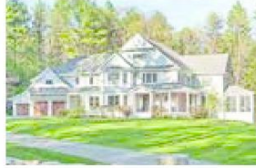
88 Hugh Cargill Road, Concord Offered at $2,799,000