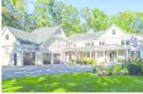
70 Squaw Sachem Trail, Concord Offered at $3,850,000