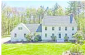
281 Pope Road, Acton Offered at $999,000