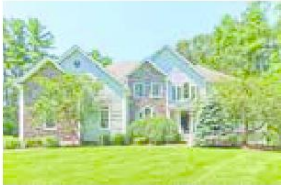
89 Davis Road, Carlisle Offered at $1,559,000