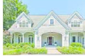
965 Bedford Road, Carlisle Offered at $1,799,000