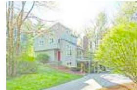
80 Tenney Road, Westford Offered at $629,900

Call us to see our Luxury Portfolio of Homes with Multiple At-Home Work & Learning Spaces!