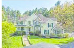
133 Hutchins Road, Carlisle Offered at $1,300,000