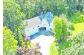
43 Prospect Street, Carlisle Offered at $1,299,000