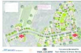
Woodward Village, Carlisle Starting in the mid $800's