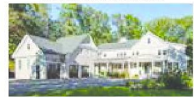
70 Squaw Sachem Trail, Concord .97 acres Offered at $3,699,000