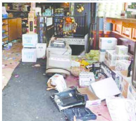
(Top Left) Calderwood Pavillion, Tremont Street, Wednesday morning. (Top Right) Urban Grape, Columbus Ave. (Bottom Left & Right) Giorgiana's, Tremont Street.