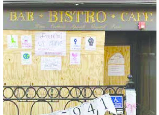
Frenchie Wine Bistro in Tremont Street, Wednesday Morning.