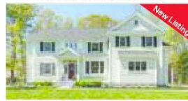
254 Monsen Road, Concord .49 acres Offered at $1,725,000