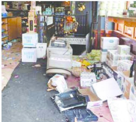
(Top Left) Calderwood Pavillion, Tremont Street, Wednesday morning. (Top Right) Urban Grape, Columbus Ave. (Bottom Left & Right) Giorgiana's, Tremont Street.