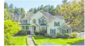
133 Hutchins Rd, Carlisle 2 acres Offered at $1,300,000