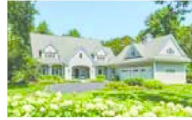
965 Bedford Rd, Carlisle 2.07 Acres Offered at $1,799,000