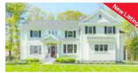
254 Monsen Road, Concord .49 acres Offered at $1,725,000