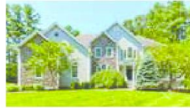
89 Davis Road, Carlisle 2.01 acres Offered at $1,509,000