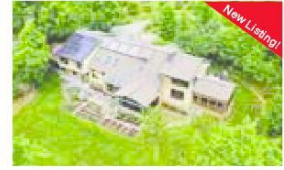
290 Rutland Street, Carlisle 5.6 Acres Offered at $1,699,000