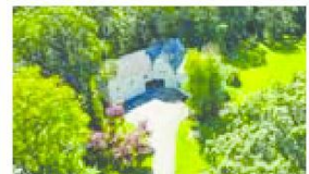
43 Prospect Street, Carlisle 2.01 acres Offered at $1,299,000

Call us to see our luxury portfolio of homes with multiple at-home work and learning spaces!