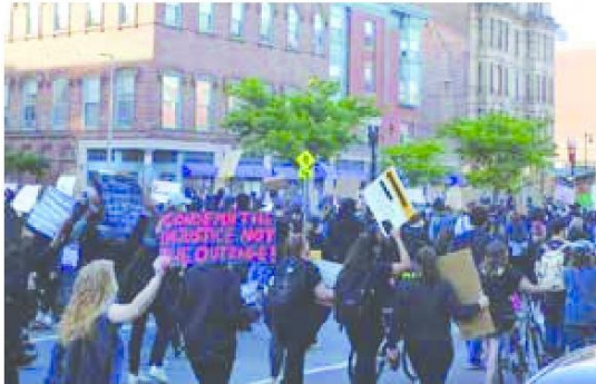
Sunday's march, Washington Street at Northampton Street.

The protests called for justice in the death of George Floyd. Floyd a Black man, was killed while handcuffed and lying face down after Minneapolis police officer Derek