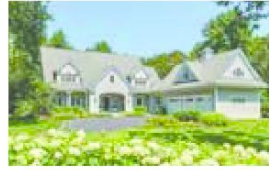
965 Bedford Rd, Carlisle 2.07 Acres Offered at $1,799,000