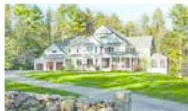
88 Hugh Cargill Road, Concord 2.87 acres Offered at $2,799,000