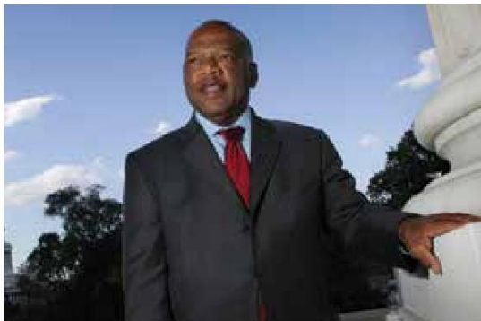
U.S. Rep. John Lewis, a Georgia Democrat and civil rights icon, died Friday at age 80.

John Lewis, the 'conscience of Congress, preached a lived theology and activism of "good trouble." Good trouble was the work of the 1960s Civil Rights Movement, and it was an expression of Lewis's faith. The