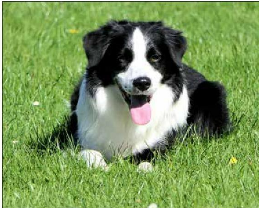
Continued on page 4