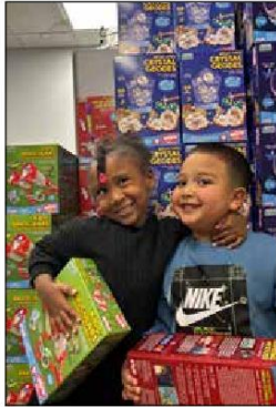
Ellis Early Learning students pose with a large donation of educational toys from Amazon for use in Ellis's STEM Exploration Labs.

Ellis received a donation in December of 375 educational toys from Amazon for use in its STEM Exploration Labs, engaging environments where young children can test their ideas, solve problems and develop their understanding of