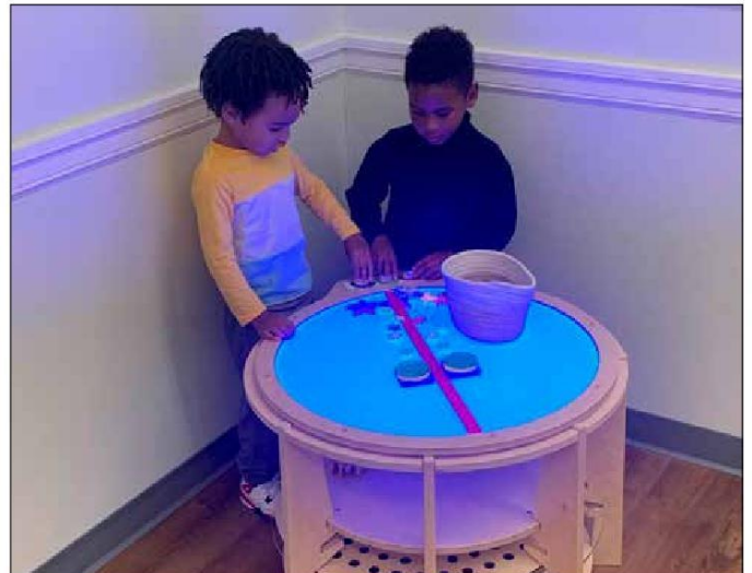
Ellis Early Learning students utilize equipment in Ellis's STEM Exploration Labs, testing their ideas, solving problems and developing understanding of complex concepts.

Ellis is committed to helping all children develop the social, emotional and academic skills they need to be successful in school and in life. The nonprofit stands out for being among the most socio-economically, racially and culturally diverse organizations serving the children of Boston. Over 60% of Ellis families receive child care subsidies from the government and 65% of participants are people of color.