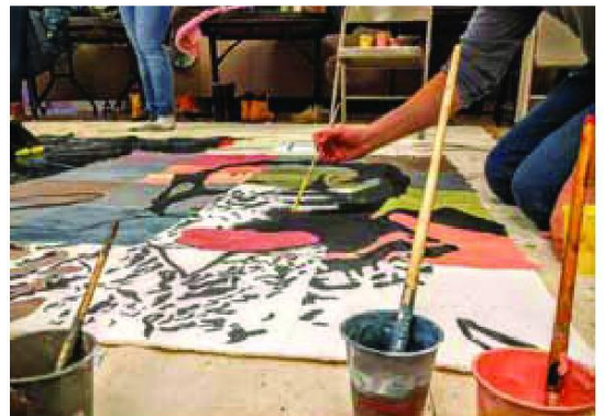
St. Stephen's 6th annual MLK Day of Action.