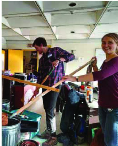
St. Stephen's 6th annual MLK Day of Action.