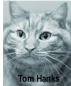
Tom Hanks ANIMAL RESCUE LEAGUE of BOSTON

Helping animals since 1979 10 Chandler Street