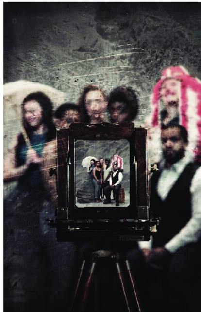
Company One & Arts Emerson's "Octoroon"