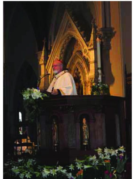
(Left) Easter at the Cathedral (Center) Cardinal O'Malley greeting people after Mass (Right) Cardinal O'Malley preaching