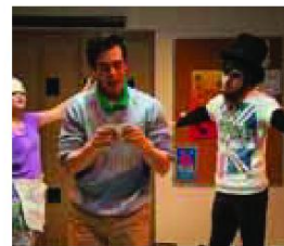
Students rehearsing in "Speech and Debate"

As the three thoughtful iconoclasts come together at the school's new Speech and Debate club, they form an unusual Three