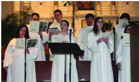
The choir singing on Easter Sunday at the Cathedral.