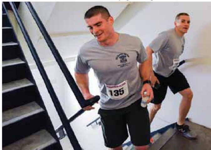
Boston Police Officers participating in the Third annual "Ginormous Climb" in the John Hancock Tower

of 200 Clarendon, formerly known as the John Hancock Tower, to climb sixty stories to the top of Boston's tallest building. This year's climb raised more than one hundred thousand dollars for kids from our communities in need of support and services as they fight back against abuse and violence.