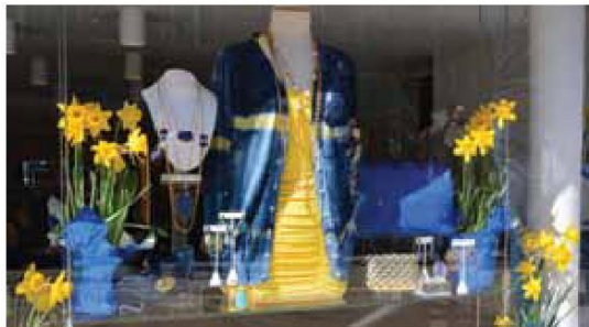
Daffodils line a South End storefront window during the annual Marathon Daffodils project.