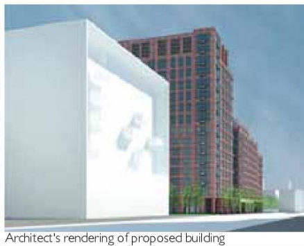
Architect's rendering of proposed building

spaces. The primary pedestrian walkway will be between rows of trees providing ample shade and definition to the pedestrian experience. Either side of the allée of trees will be populated with locations for outdoor seating and other activities. The spatial arrangement of walkway and trees will allow for multiple potential uses that can provide both public and commercial amenities to the neighborhood. Mid-block along Harrison Avenue, the tree-lined walkway will expand further into a courtyard that will be a public extension of the sidewalk, emphasized by the planting strategy. Open to the sidewalk and street on one side, and surrounded by potential building program on the other three sides, the courtyard will allow for dining, retail or other activities to open onto it. With a great deal of new and proposed development, the intersection of Harrison Avenue and Traveler Street has been identified as a destination node by the Harrison Albany Corridor Study. The design of the landscape and building each respond