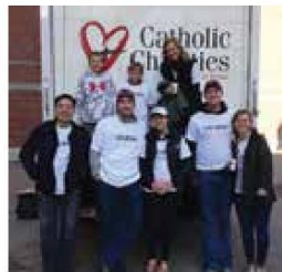
The Thanksgiving Project