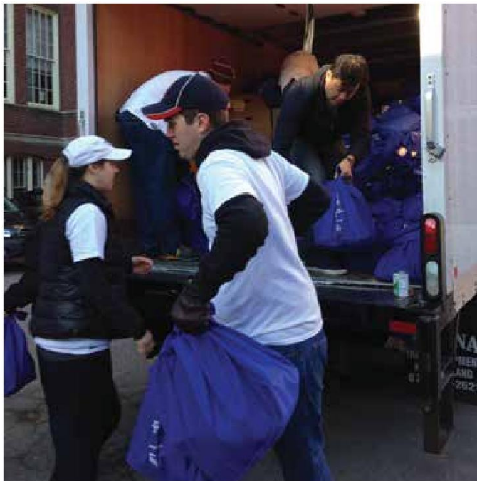
The Thanksgiving Project

The Thanksgiving Project this year is made possible by support from Mass Convention Center Authority, who donated the space, Stop & Shop, UPS, Putnam, DDJ Capital Management, Federal Home Loan Bank and Falcon Investment Advisors.