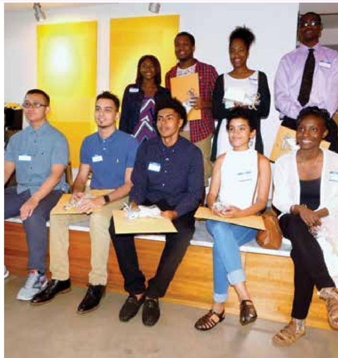
Continued on page 5 BPSNA's 2016 Scholarship recipients.

McKinley South End Academy, Blackstone Elementary School get BPS Arts Expansion Fund Grants.