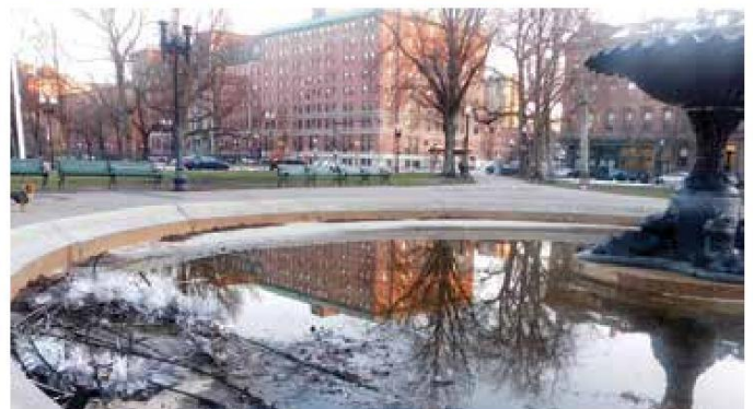
(Above) Photos of Blackstone Park