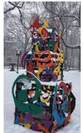
"Emergence" in Franklin Square