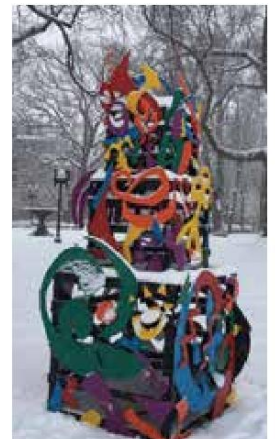
"Emergence" in Franklin Square