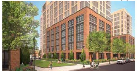
Harrison Albany Block rendering.