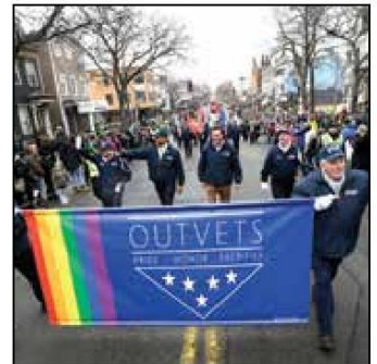
St. Patrick’s Day parade 2015, in Boston’s South Boston neighborhood

“It’s a veterans parade. Veterans groups