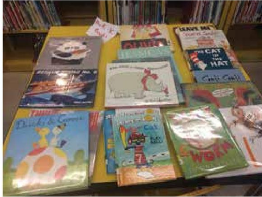
Books for RAAD.

On Friday, March 3, the Blackstone Innovation School and St. Stephen's Youth Programs celebrated reading and literacy with the Seventh Annual Read Across America Day. This is a nationwide event and is timed to fall near the birthday of many youngsters' favorite author, Dr. Seuss. Here in the South End, volunteers from non-profit organizations, faith-based groups, and corporate partners gathered in