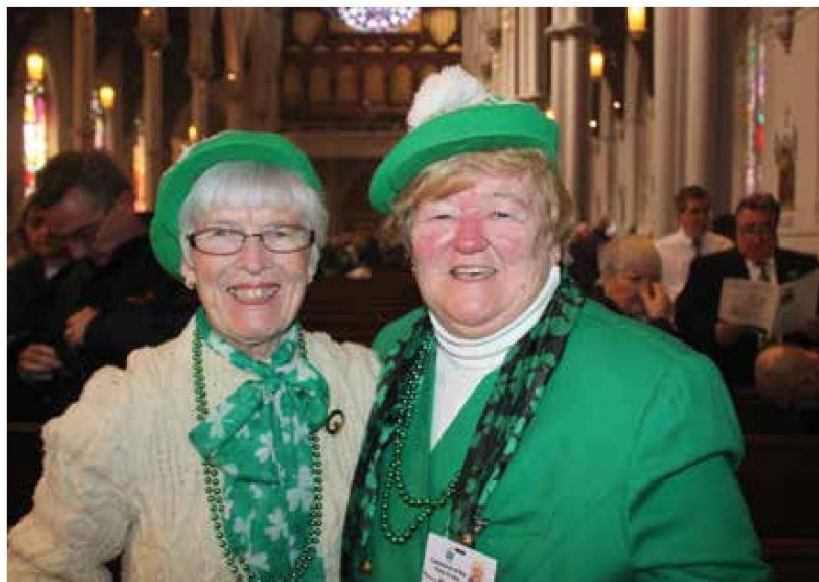
Parishioners decked out in green for the occasion

Archbishop of Boston Cardinal Sean Patrick O'Malley and parishioners at the Cathedral of the Holy Cross celebrated Mass on St. Patrick's Day last Sunday. Visitors from Ireland were welcomed.