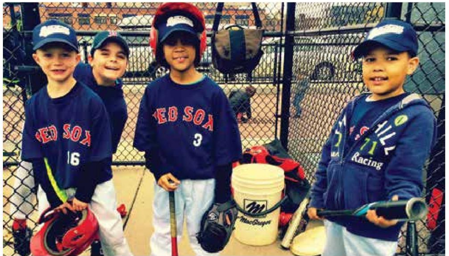
South End Baseball is a non-profit organization that provides a comprehensive youth baseball program. More at www.southendbaseball.com