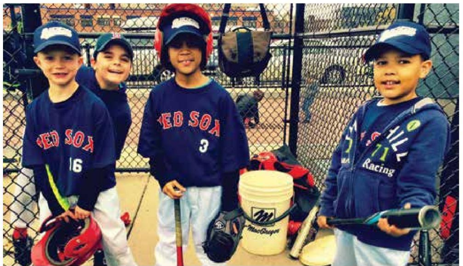
South End Baseball is a non-profit organization that provides a comprehensive youth baseball program. More at www.southendbaseball.com