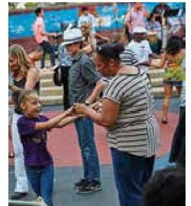
2016 Tito Puentes Concert