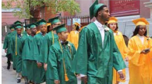
Cathedral grads file into St. James Church