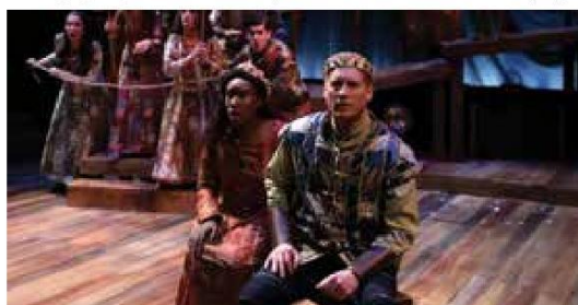
Guenevere and King Arthur in Lyric Stage Company's "Camelot"