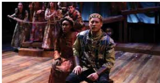
Guenevere and King Arthur in Lyric Stage Company's "Camelot"