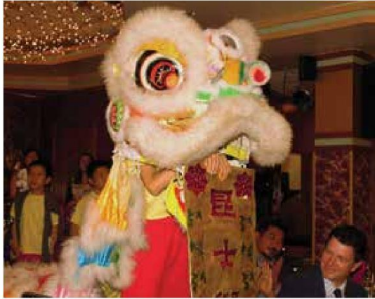
The Lion Dance.