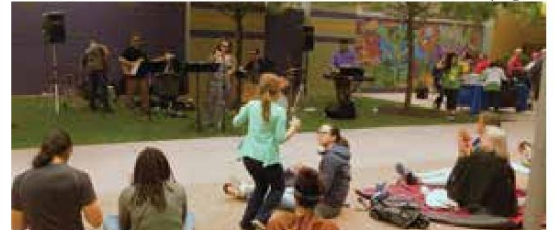
Warren Avenue Breakdown at Frieda Garcia Park.