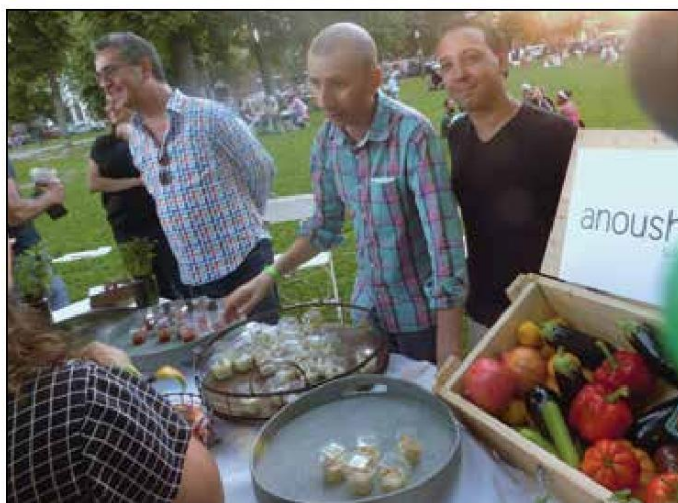
(Bottom Right) Anoush'Ella sample table.