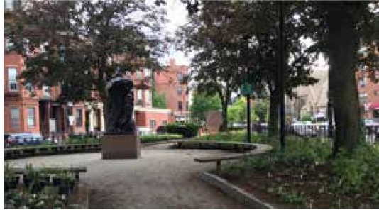
Harriet Tubman Park in the South End