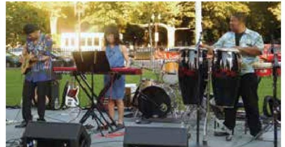
Carmelia Latin Jazz Band.