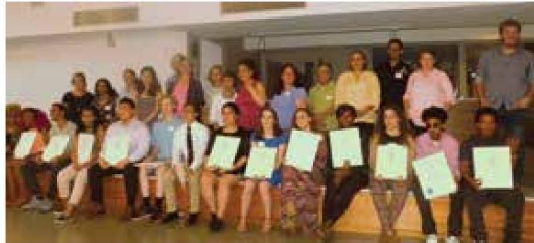
2017 B/FSNA scholarship recipients.

The Blackstone/Franklin Square Neighborhood Association (B/FSNA) scholarship committee gave out a total of $33,500 in awards to 12 rising high school seniors and three continuing college students at a reception on Tuesday, June 20 at