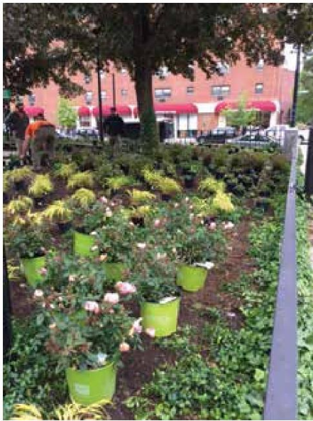
Harriet Tubman Park in the South End

This verdant oasis which until now had only had minimal grown ivy ground cover now has