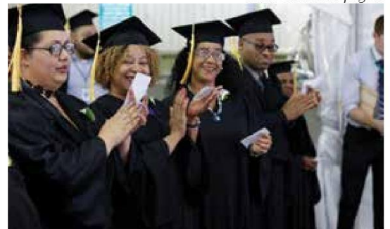
Graduates applaud one of the graduation speakers.