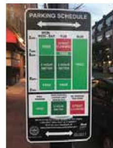
South End Parking Schedule

The City of Boston's civic research and development team, the New Urban Mechanics, have launched a pilot to test new parking signage. The New Urban Mechanics is the City's civic research and development team, which pilots experiments that aim to improve the quality of life for Boston's residents.