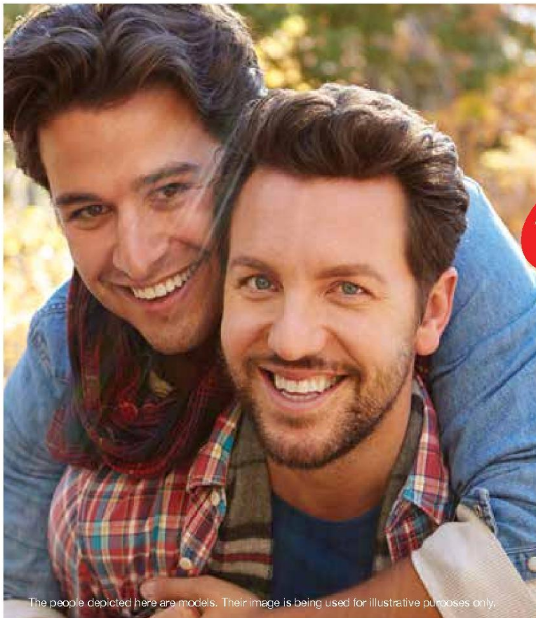
The people depicted here are models. Their image is being used for illustrative purposes only.

We are the future of the LGBT community.