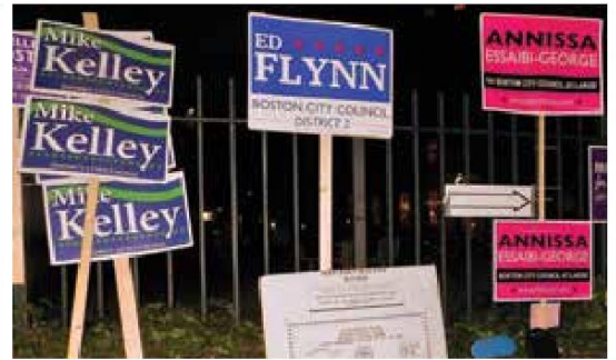
Outside Benjamin Franklin Institute of Technology.