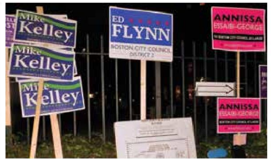
Outside Benjamin Franklin Institute of Technology.