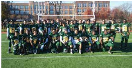
The Cathedral High School Football team on Thanksgiving Day.