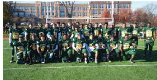
The Cathedral High School Football team on Thanksgiving Day.