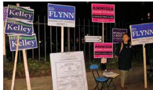
Outside Benjamin Franklin Institute of Technology.

The District 2 result was not declared until a final precinct in Chinatown was counted, with the announcement coming around 11:00 PM. The District 7 seat being vacated by mayoral hopeful Tito