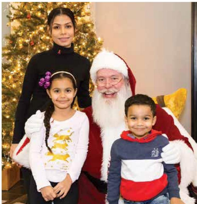
(Top) Celebration of Life Ballroom with Guests. (Bottom) Family taking photo with Santa