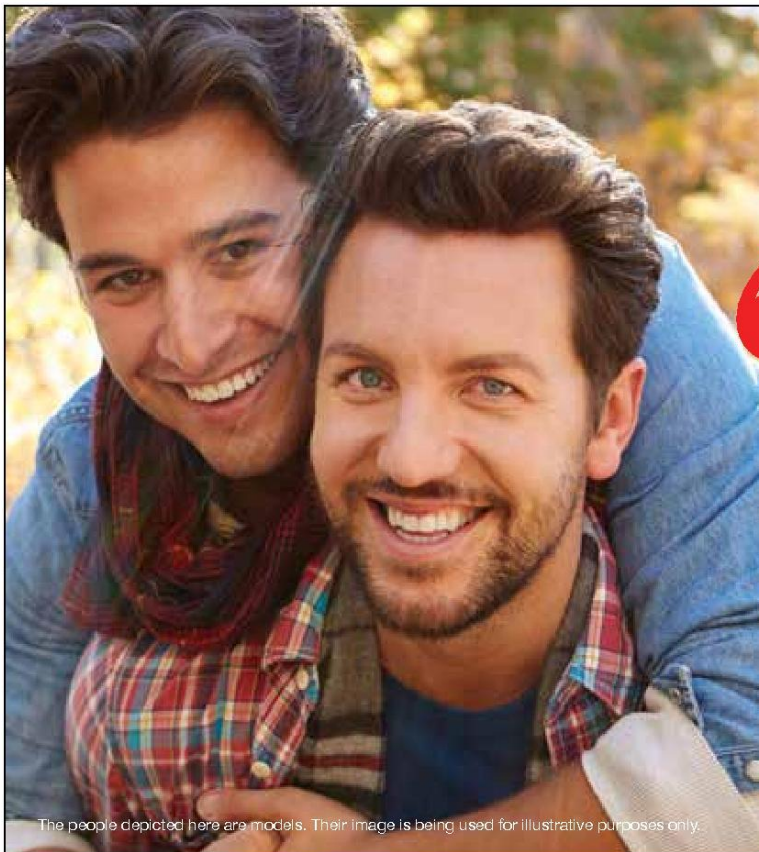
The people depicted here are models. Their image is being used for illustrative purposes only.

We are the future of the LGBT community.