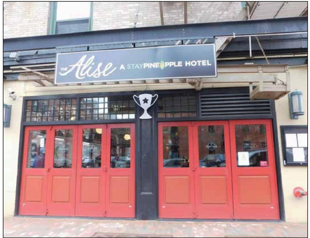
The Alise Hotel remodeled from The Chandler Inn.