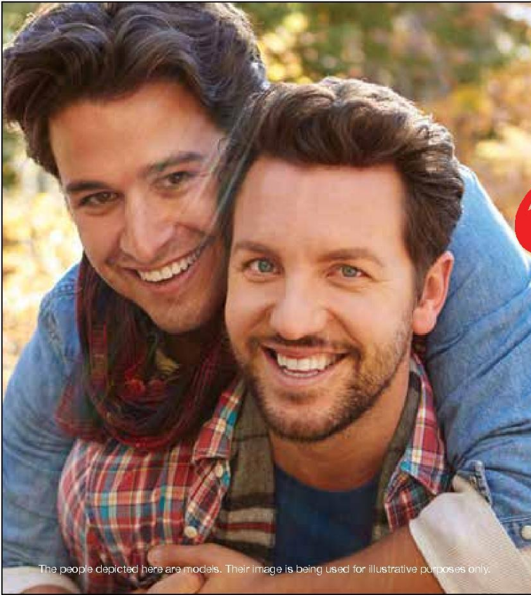
The people depicted here are models. Their image is being used for illustrative purposes only.

We are the future of the LGBT community.