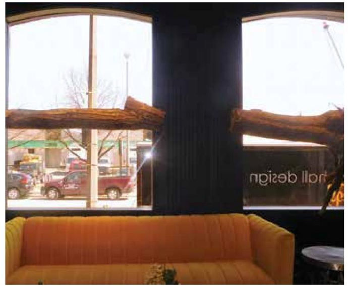
Window décor from fallen tree.