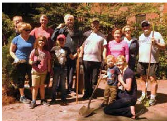
Wellington Green volunteers.