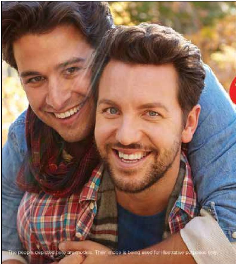
The people depicted here are models. Their image is being used for illustrative purposes only.

We are the future of the LGBT community.