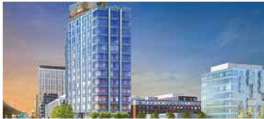
"217 Albany Street"

The Boston Planning & Development Agency (BPDA) Board of Directors approved four development projects and one Notice of Project Change at their July meeting. The projects will generate a total of 870