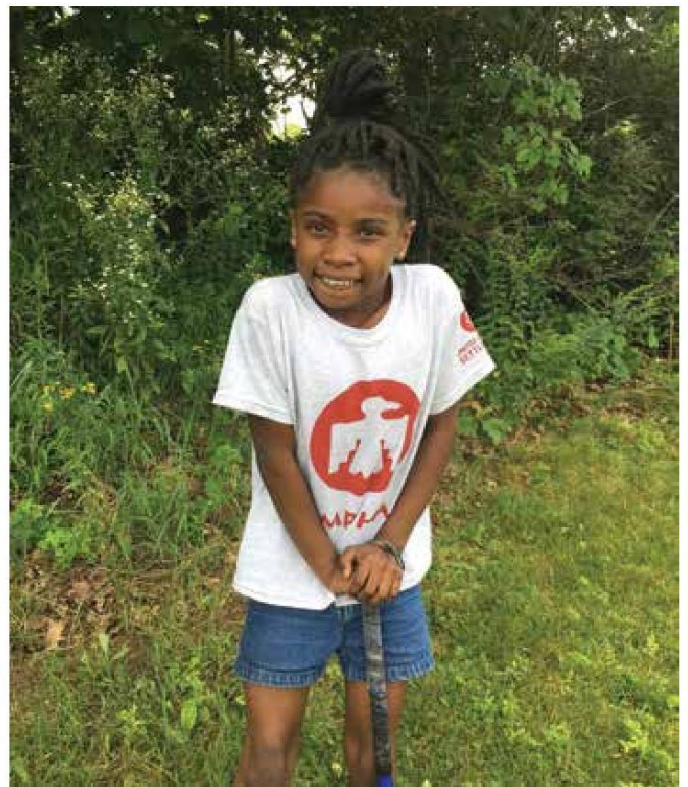
(Left) It was a fight to the finish line for two Camp Hale campers participating in a race during the Camp's Old Home Day celebration in Sandwich, NH. (Right) One Camp Hale camper preparing to go up to bat at a softball game to celebrate Old Home Day in Sandwich, NH.