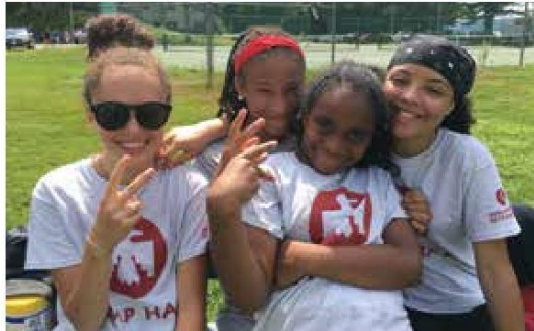
Camp Hale campers getting ready to cheer on their friends at the Camp's softball game to celebrate Old Home Day in Sandwich, NH.