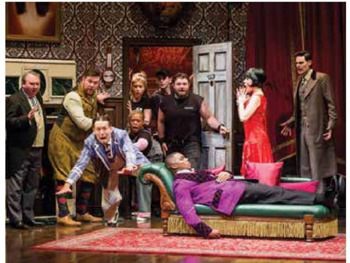
National tour of "The Play That Goes Wrong"

Did the butler do it? Agatha Christie buffs are likely to figure out which of her mysteries this hilarious take-off resembles and the identity of the murderer. Everyone will warm to the production's spirited playfulness. It is no spoiler alert to reveal that "The Play That Goes Wrong" always goes right.