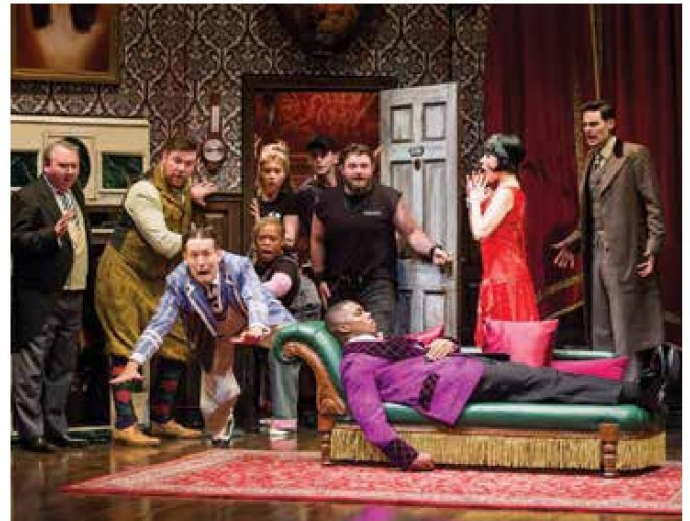
National tour of "The Play That Goes Wrong"

Did the butler do it? Agatha Christie buffs are likely to figure out which of her mysteries this hilarious take-off resembles and the identity of the murderer. Everyone will warm to the production's spirited playfulness. It is no spoiler alert to reveal that "The Play That Goes Wrong" always goes right.