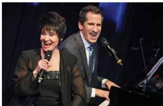
Chita Rivera and Seth Rudetsky perform at The Wallis Annenberg Center for the Performing Arts.