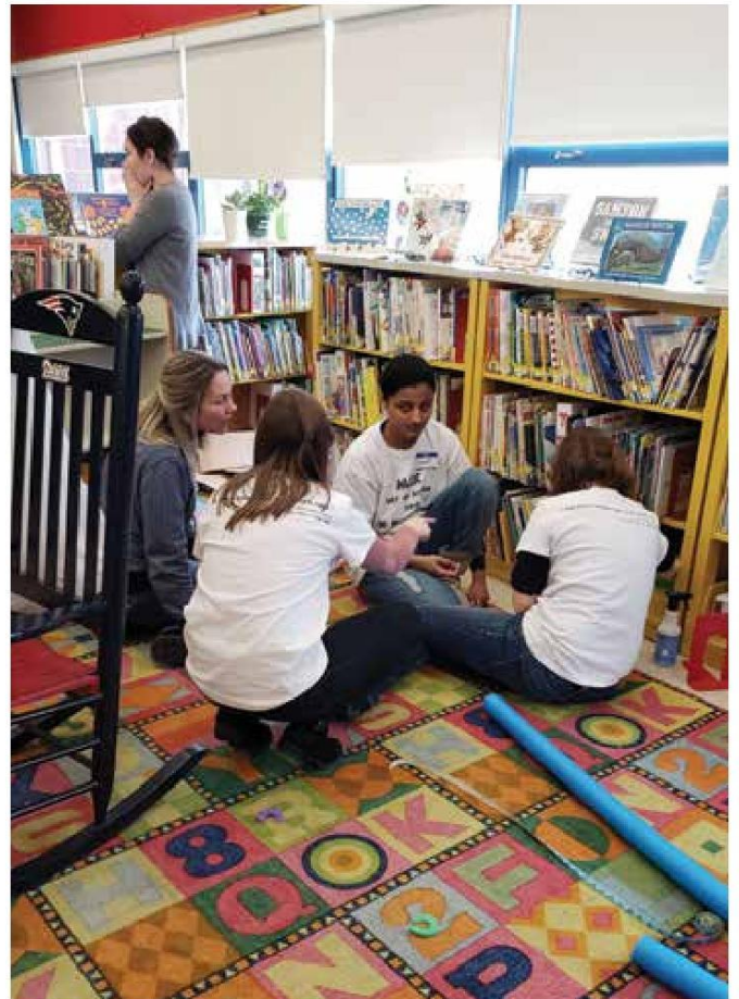
(Top Left) Young volunteers assembled care packages for Blackstone students taking the MCAS test. (Top Right) Volunteers from Congregation Dorshei Tzedek bring beauty to the Blackstone School. (Bottom Left) Words to live by at the Blackstone School! (Bottom Right) Volunteers improve shelving in Blackstone Library