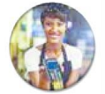
Instant issue EBSB ATM/VISA® check card

PLUS, GET YOUR CHOICE OF A FREE GIFT WHEN YOU OPEN ANY NEW CHECKING ACCOUNT!***