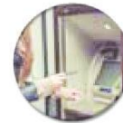
Access to Allpoint® network with your EBSB ATM/VISA® check card