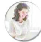
Online Banking, Bill Pay and e-Statements