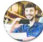
Mobile Banking, People Pay and Check Deposit