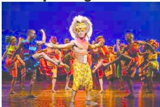
Ensemble number, "The Lion King"

While the gifted Brookline native (an innovative revival of "The