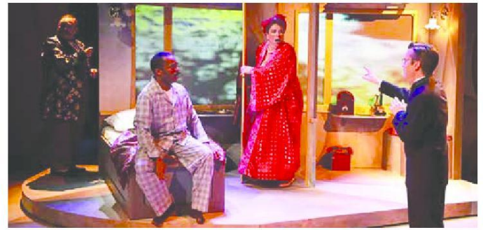
Lyric Stage Company of Boston production of "Agatha Christie's Murder on the Orient Express."