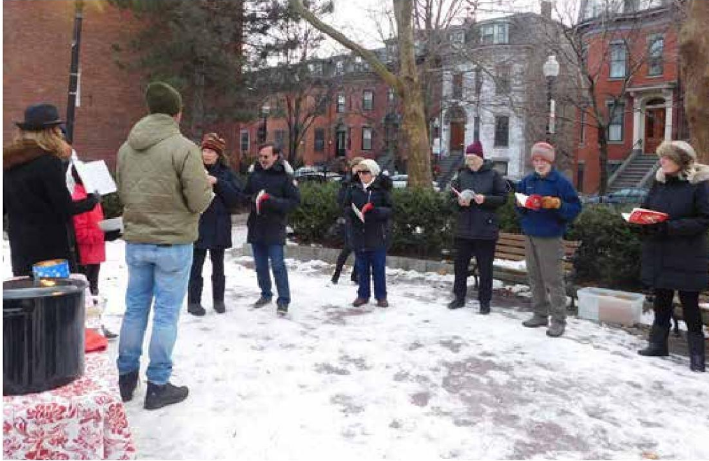
Caroling in Hayes Park.