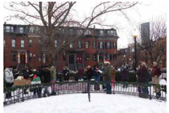
Caroling in Hayes Park.