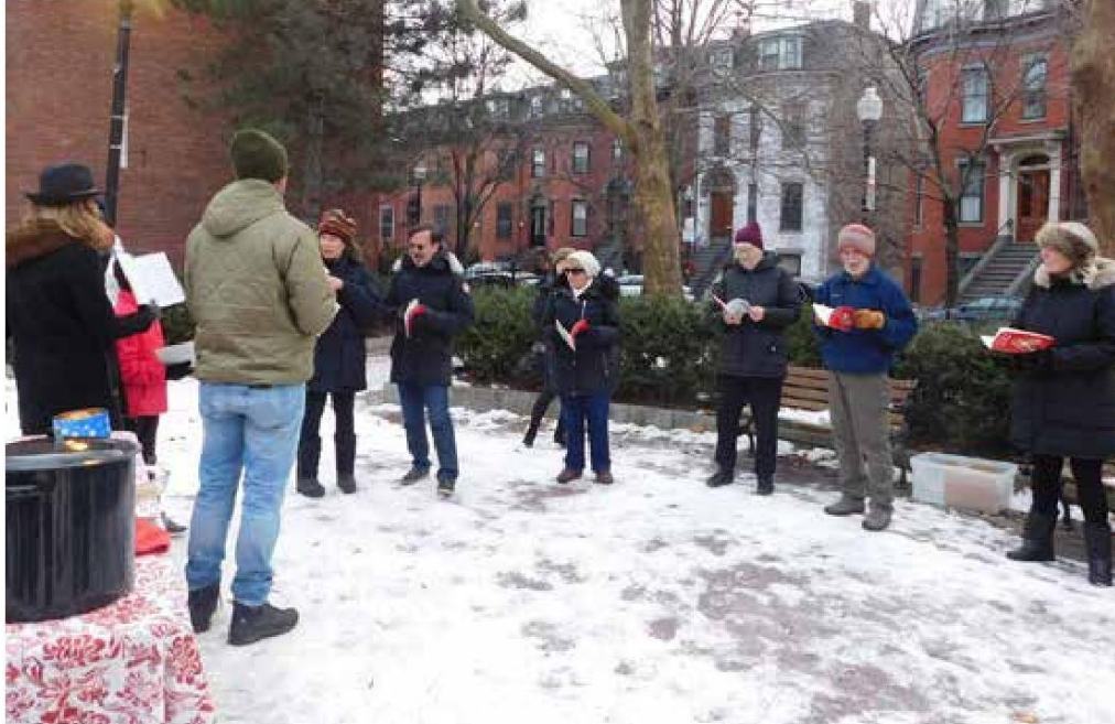
Caroling in Hayes Park.