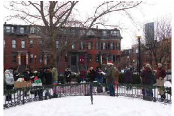
Caroling in Hayes Park.