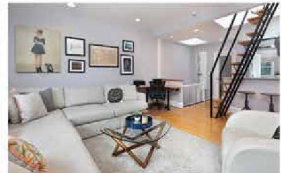
68 Appleton Street, Unit 4, South End Sold | $775,000