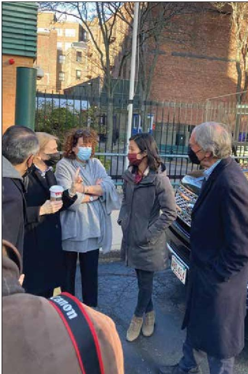
Representative Aaron Michlewitz, Mayor Michelle Wu, and Senator Ed Markey.