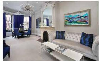
32 Rutland Square, Unit 1, South End Sold | $2,450,000