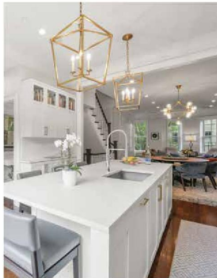
8 Rutland Square, Unit 2, South End Active | $3,795,000

Each office is independently owned and operated.