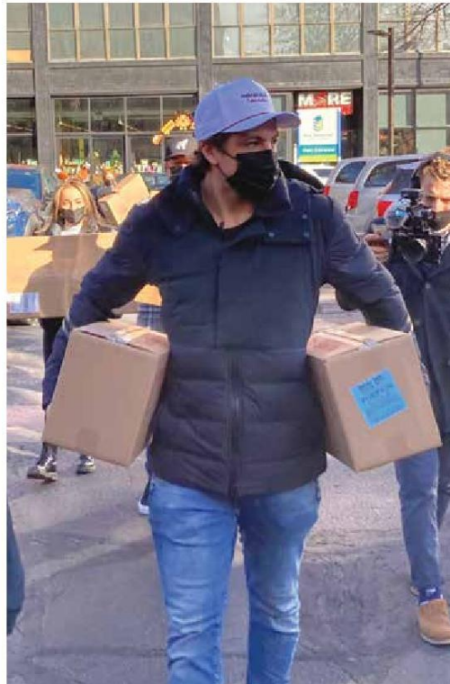
Bruins' Charlie McAvoy.