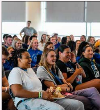
Boston-based nonprofit hosted the awards presentation at the annual Fellowship Summit honoring the fellows' outstanding work with Team IMPACT.