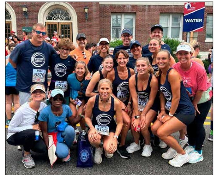
Team BCP

products to patients and their families who need it. The practice was created with a mission to provide equitable pediatric healthcare to all children throughout the area regardless of insurance or a family's ability to pay.