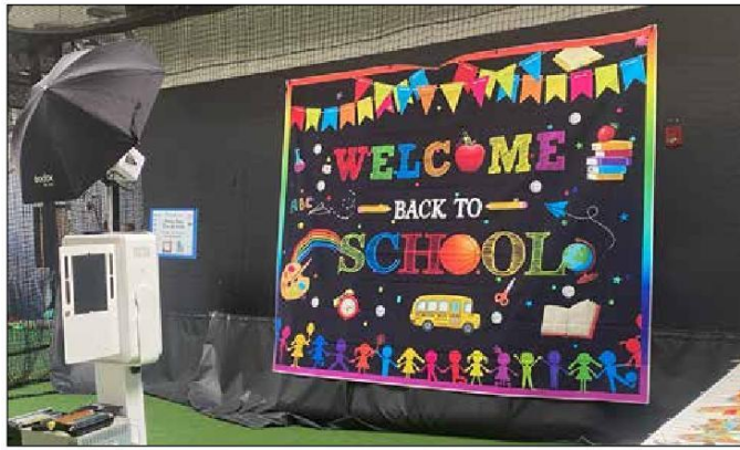
Students had a chance to get their picture taken during a Back-to-School photo shoot.

Families also took home bags of fresh fruits and vegetables and non-perishable goods provided by the YMCA/Greater Boston Food Bank. Finally, BCP would like to acknowledge