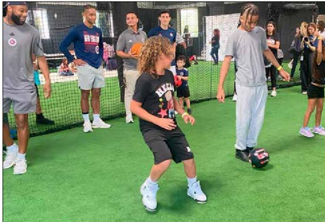
Players from the New England Revolution playing soccer with the children in attendance.

NCL Wellesley, all the volunteers, and the dedicated BCP staff and interns for their unwavering commitment and hard work.