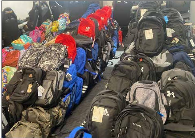
320 free backpacks distributed at the annual BCP Back-to-School event.