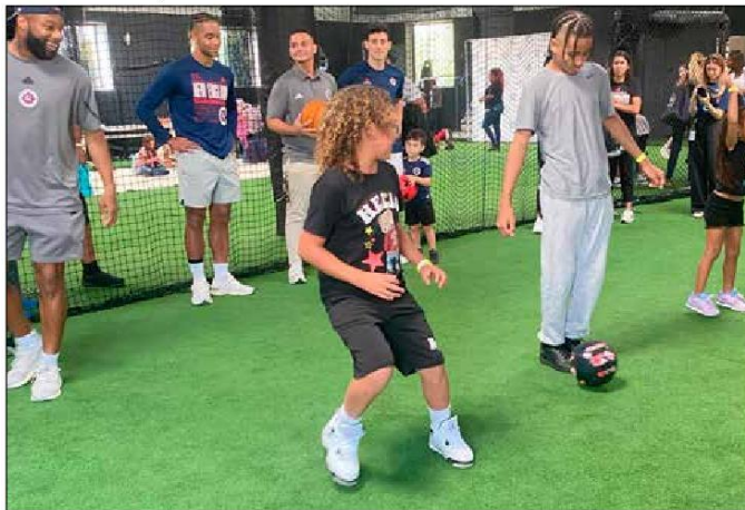
Players from the New England Revolution playing soccer with the children in attendance.

NCL Wellesley, all the volunteers, and the dedicated BCP staff and interns for their unwavering commitment and hard work.