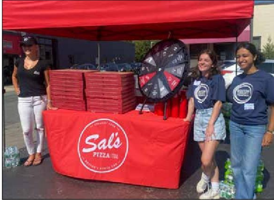
Sal's Pizza handing out free pizza with a chance to win a free prize.