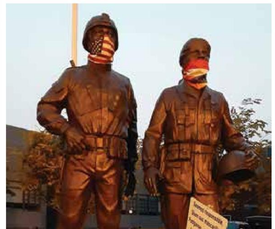
(Top) Monument to baseball legend Roberto Clemente. (Bottom) Monument to 65th Infantry Regiment "Borinqueneers".