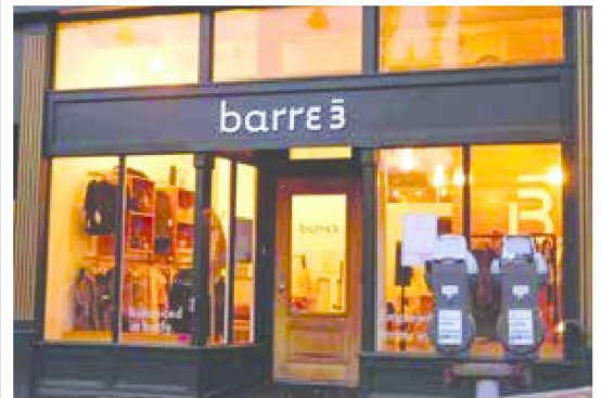
Barre 3, a Buy-A-Bite participant.

Last week, a developer asked the BPDA for permission to change 148 planned apartments to condos in a building under construction on Lagrange Street in Chinatown. Last year, as the pandemic crashed into Boston, developers had said lenders were reluctant to put money into new condo projects.