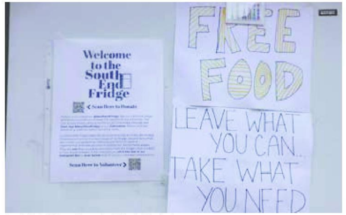
South End Fridge.