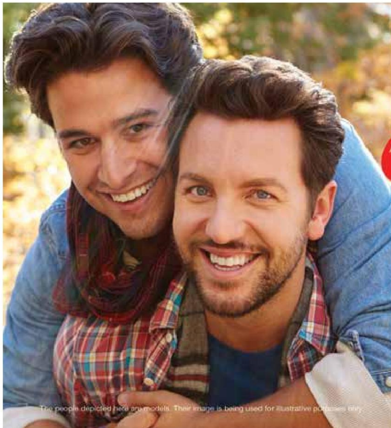
The people depicted here are models. Their image is being used for illustrative purposes only.

For more information on the film festival, visit www.roxfilmfest.com