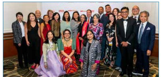
The Asian Community Fund leadership and staff, Gala Co-Chairs, steering committee, partners and honorees together at the Asian Community Fund's Inaugural Gala

The Asian Community Fund (ACF) at the Boston Foundation (TBF) convened more than 550 AAPI leaders, allies, and partners for an evening dedicated to advancing AAPI representation, leadership, and narrative change in Massachusetts. The Inaugural Gala raised more than $725,000 in donations, proceeds which will