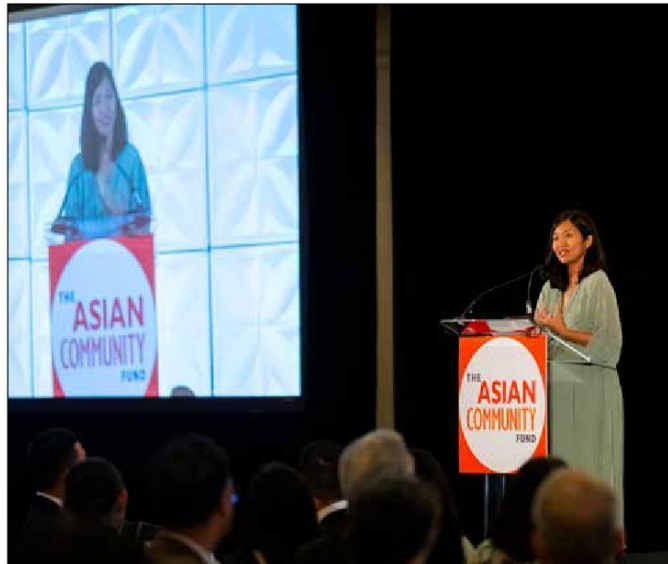
City of Boston Mayor Michelle Wu delivering the keynote address at the Asian Community Fund's Inaugural Gala.