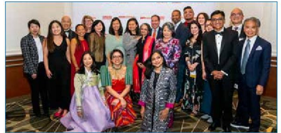
The Asian Community Fund leadership and staff, Gala Co-Chairs, steering committee, partners and honorees together at the Asian Community Fund's Inaugural Gala

The Asian Community Fund (ACF) at the Boston Foundation (TBF) convened more than 550 AAPI leaders, allies, and partners for an evening dedicated to advancing AAPI representation, leadership, and narrative change in Massachusetts. The Inaugural Gala raised more than $725,000 in donations, proceeds which will