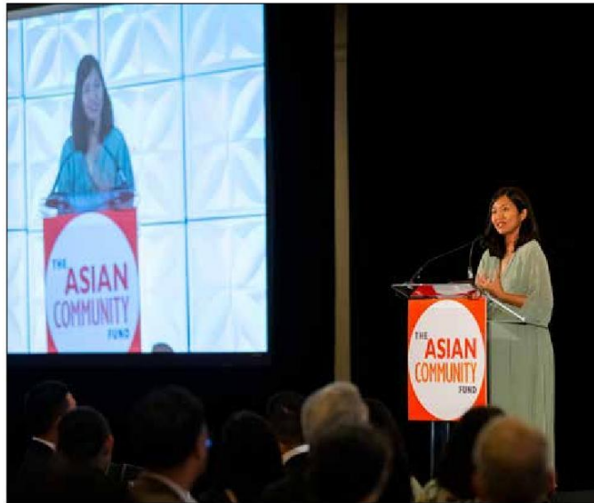
City of Boston Mayor Michelle Wu delivering the keynote address at the Asian Community Fund's Inaugural Gala.