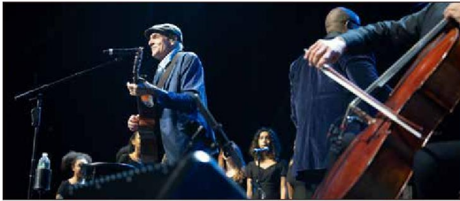
James Taylor performing with BAA's Spiritual Ensemble.

Several other well-known artists, performers, designers and philanthropists were honored at the event with a special guest performance from singer and songwriter James Taylor. BAA students performed with musician James Taylor. In total, $1.65 million was raised to benefit Boston Arts Academy students.