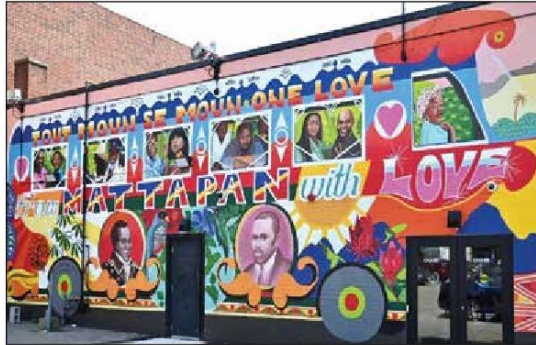
Tout Moun Se Moun/One Love: Mattapan Tap Tap Mural.

Mayor Michelle Wu, together with the Boston Parks and Recreation Department, shared recent projects that the Mayor's Mural Crew completed during its 30th