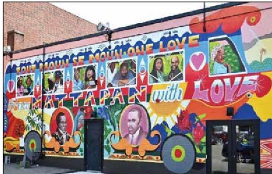
Tout Moun Se Moun/One Love: Mattapan Tap Tap Mural.

Mayor Michelle Wu, together with the Boston Parks and Recreation Department, shared recent projects that the Mayor's Mural Crew completed during its 30th