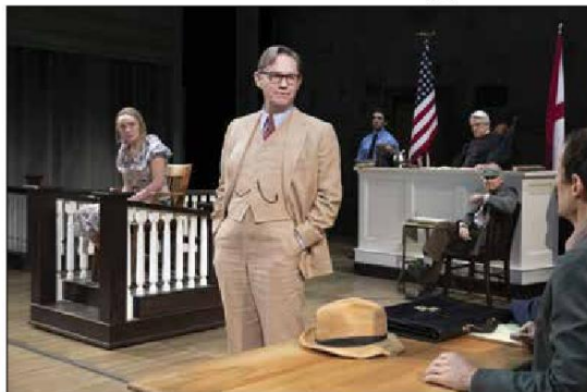
Richard Thomas as Atticus Finch (center) in Broadway tour of Aaron Sorkin's adaptation of "To Kill a Mockingbird"

Plays adapted from seminal novels are always a great challenge, and Harper Lee's iconic novel "To Kill a Mockingbird" is all the more so. After all, Gregory Peck earned a best actor Oscar in the fine 1962 film with a performance that brought gravitas and singular stature to Alabama lawyer Atticus Finch. Recently