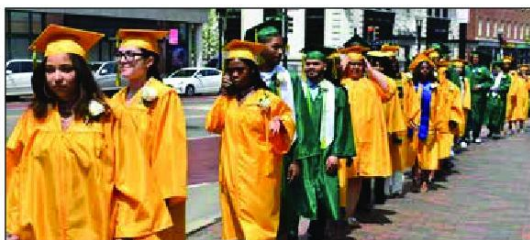
Here comes the Class of 2022 arriving for the 91 commencement on Saturday, May 21, 2022 outside the Cathedral of the Holy Cross.