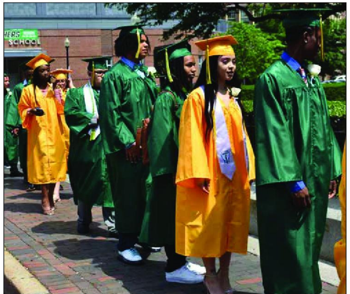
Here comes the Class of 2022 arriving for the 91 commencement on Saturday, May 21, 2022 outside the Cathedral of the Holy Cross.