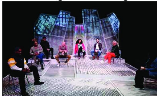
Cast of Lynn Nottage play "Fabulation or, The Re-Education of Undine" at the Lyric Stage Company.

Fabulation or, The Re-Education of Undine , Lyric Stage Company of Boston, through October 9. 617-585-5678 or lyricstage.com