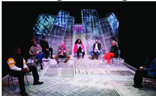
Cast of Lynn Nottage play "Fabulation or, The Re-Education of Undine" at the Lyric Stage Company.

Fabulation or, The Re-Education of Undine , Lyric Stage Company of Boston, through October 9. 617-585-5678 or lyricstage.com