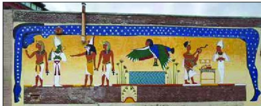
Large-Scale Mural Designed and Painted by Emerging Young Leaders of Boston's Mayor's Mural Crew

The City of Boston and Beyond King Tut: The Immersive Experience have announced Boston's newest public work of art: a large-scale mural titled "Tutankhamun's Journey into the Afterlife". The mural is located on the South End's Leon Electric building, at the corner of Harrison Avenue and Perry Street. The mural honors the